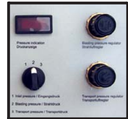
Separate regulation for blasting and transport air