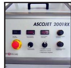
Control panel for easy overview