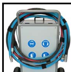
Integrated holding device for hose