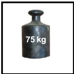
Lightweight and compact