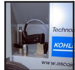
Box for gun, nozzles and tools