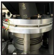
Distributor unit for pulsation-free blasting