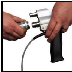
Powerful and handy blasting gun with quick connect coupling