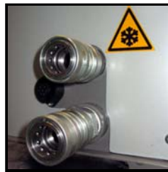
Double hose system for maximum performance